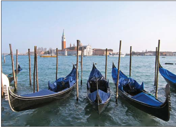
Michele R. Sassi. Gondolas, Venice, Italy . Photograph.

To use targeted therapies optimally for treatment of metastatic kidney cancer, clinical issues besides those addressed in pivotal treatment trials should be recognized.