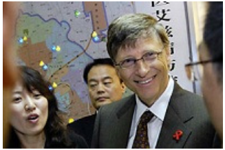
Bill Gates invested in Foundation Medicine.

Already considered a novelty in cancer medicine, Foundation's $5,800 complex molecular test provides a more comprehensive look at a patient's cancer--allowing doctors to test a tumor sample for 280 different genetic mutations that could be driving tumor growth. This is different from current first-generation genetics tests for cancer, which are designed to find one or a few genomic alterations.