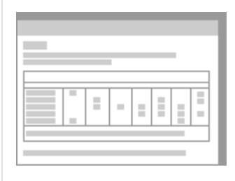
Table 2 - The relationship between clinicopathological factors and cancer-specific survival in patients undergoing curative nephrectomy for renal clear cell cancer: univariate and multivariate survival analysis.

The relationship between clinicopathological factors and cancer-specific survival in patients undergoing curative nephrectomy for renal clear cell cancer is shown in Table 2 . A total of 169 patients were studied. The majority was male (63%), under the age of 60 years (54%), had good performance status (82%), had T stage I/II disease (53%) and had absence of tumour necrosis (62%). The majority had an mGPS of 0 (69%) before surgery.